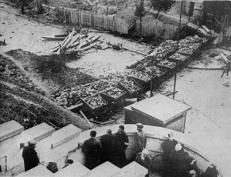
THE BARRICADES IN THE CITY