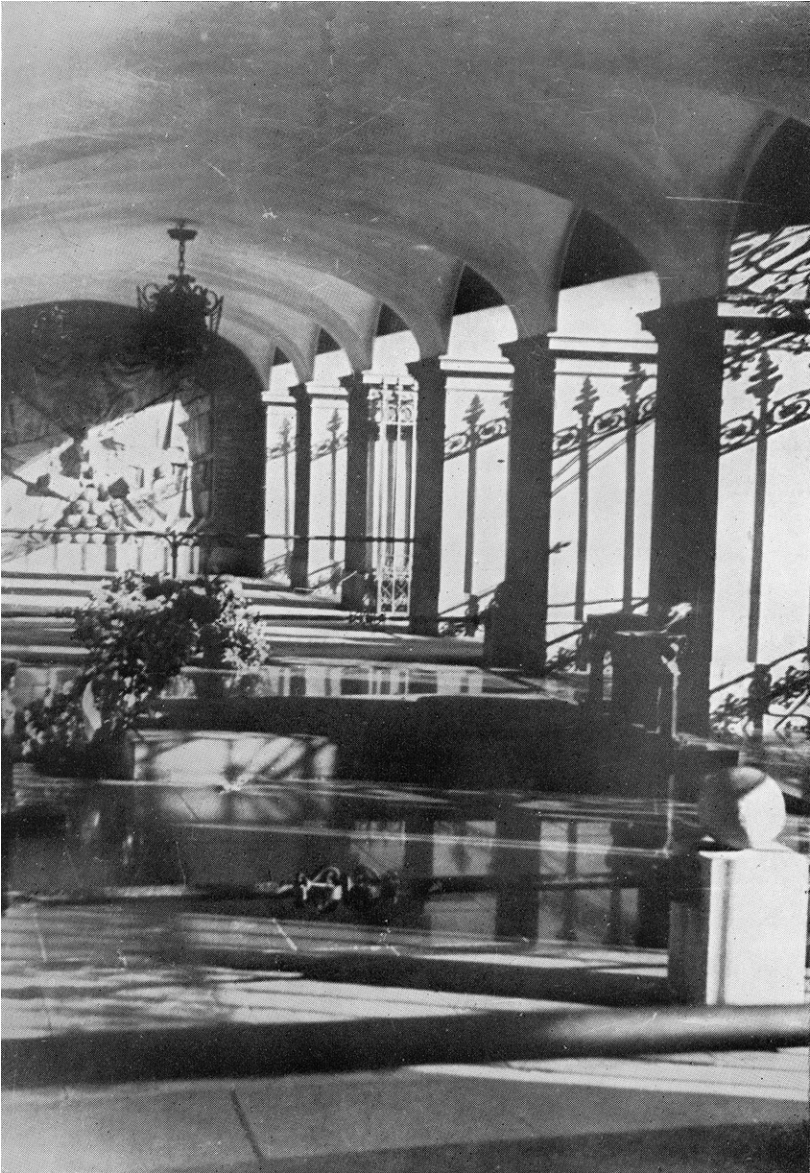
GRAVE OF THE UNKNOWN SOLDIER