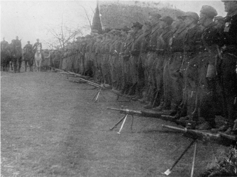
INSPECTION OF A DETACHMENT OF THE HOME ARMY

At the head of the Home Army is its Commandant, directly subordinated to the Commander-in-Chief, whose headquarters are at present in London. Its activities as a whole were directed to two ends: the weakening of the German war potential on the eastern front, and the preparation of the terrain for future military operations in Poland. In this regard also the Warsaw rising was the result of years of preparatory organization. Further, the Home Army possesses antennae, as it were, with which it reaches the interior of the Reich-organized Polish labourers who were deported for work in Germany. They will prove a hard nut for the Germans to crack.