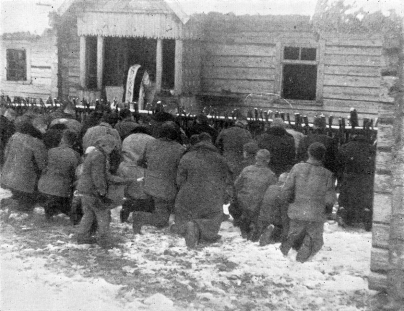
Soldiers of the Polish Underground Army kneeling in prayer before going into battle