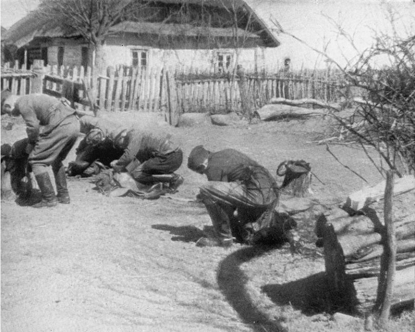
FINAL PREPARATIONS, ON EVE OF ACTION. EXAMINATION OF EQUIPMENT

Bombing from air stopped - but enemy artillery very active especially in STARE MIASTO sector.