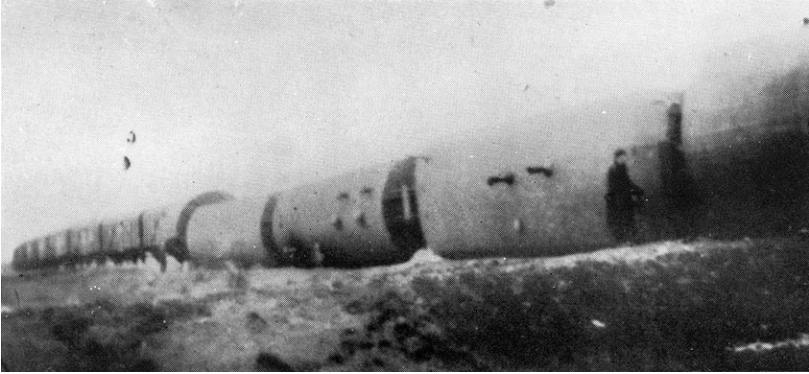
THIS WAS A TROOP TRAIN

In the period preceding the issue of the order Burza , the Home Army had worked without a pause, and thanks to its efforts much Soviet war material had been saved and much Soviet bloodshed spared.